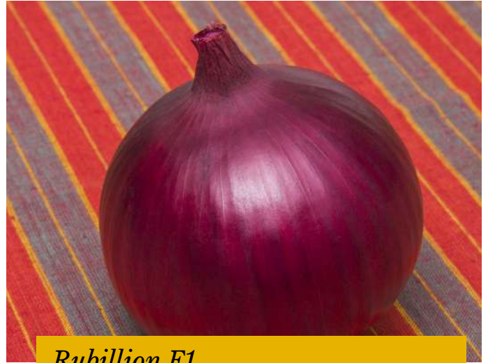
Rubillion F1 Early long day red

TYPE LONG DAY | MARKET FRESH, MEDIUM STORAGE | MATURITY EARLY | LATITUDE RANGE 45°- 50° | AVERAGE SIZE 60-80 MM | BULB SHAPE ROUND | SKIN COLOUR SHINY BROWN