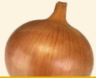
Bruce F1 Onion Rijnsburger

TYPE RIJNSBURGER | MARKET LONG STORAGE | MATURITY EARLY | LATITUDE RANGE 45°-55° | AVERAGE SIZE 50-70 MM | BULB SHAPE ROUND, SLIGHTLY FLAT | SKIN COLOUR YELLOW BRONZE