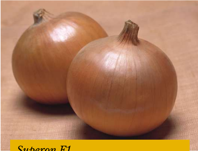
Superon F1 Early long day

Forms a strong root system and a vigorous plant. Adaptable for various growing conditions. The fine neck makes easy and fast drying possible. Strong in single centres. Excellent skin quality.