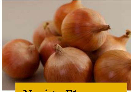
Novista F1 Onion Rijnsburger

TYPE RIJNSBURGER | MARKET LONG STORAGE | MATURITY EARLY | LATITUDE RANGE 45°-55° | AVERAGE SIZE 50-70 MM | BULB SHAPE ROUND, SLIGHTLY FLAT | SKIN COLOUR RED