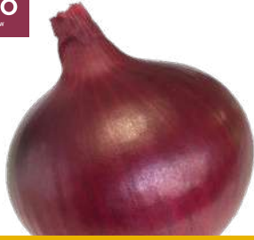
Ruby Star F1 Onion Rijnsburger

Earliest maturing red onion for long storage in North Europe. The variety grows strong in early season and bulbing starts right after the longest day. Uniform, fine neck and good yield.