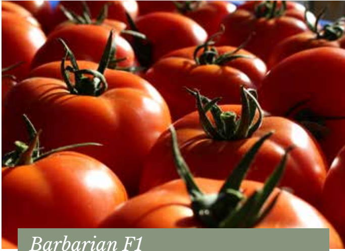
Barbarian F1 Small beef

Medium vigorous plant, suitable for both, spring and autumn season, for short cycle - up to 10 clusters. Allows to harvest on "pintón" stage.