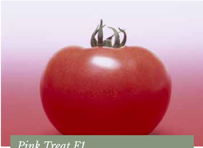
Pink Treat F1 Speciality

Pink Treat is a Momotaro tomato variety with slightly ribbed shoulders and a multi locular structure. It produces clusters with 4-5 fruits, suitable for loose harvest only. Suitable for transportation.