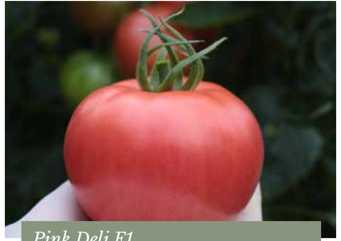
Pink Deli F1 Speciality

TYPE SPECIALITY | MARKET FRESH | FRUIT WEIGHT 250 GR | FRUIT COLOUR PINK | FRUIT SHAPE FLAT ROUND | RESISTANCES HR: TOMV:0-2/VA:0/VD:0/FOL 0-2/FOR/FF:A,D//MA,MI,MJ