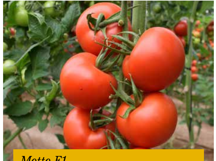
Motto F1 Truss Medium

TYPE TRUSS MEDIUM | MARKET FRESH | FRUIT WEIGHT 110 GR | FRUIT COLOUR DEEP RED | FRUIT SHAPE ROUND TO FLAT ROUND | RESISTANCES HR: TOMV:0/VA:0/VD:0/FOL:0,1 | IR: TYLCV