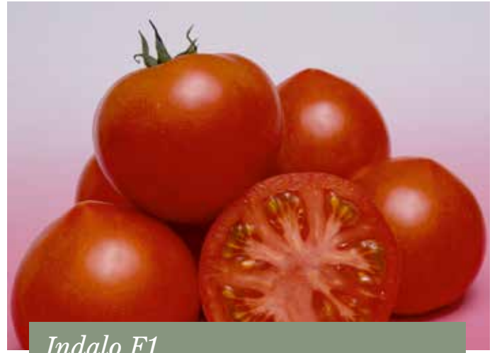
Indalo F1 Small beef

TYPE BEEF | MARKET FRESH | FRUIT WEIGHT 230 GR | FRUIT COLOUR DEEP RED | FRUIT SHAPE ROUND FLAT | RESISTANCES HR: TOMV:0-2/VA:0/VD:0/FOL:0,1/FOR/ MA,MI,MJ/TSWV | IR: TYLCV