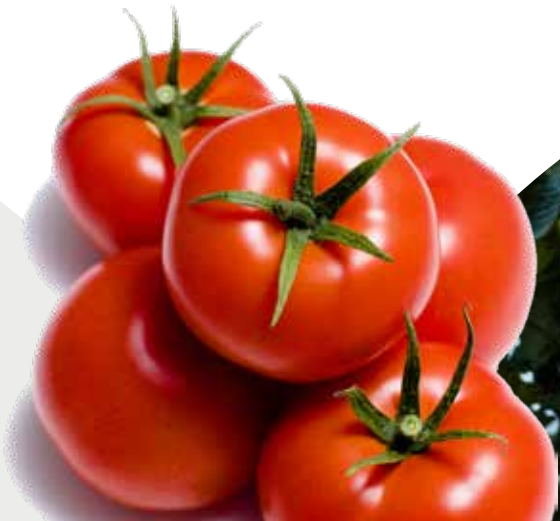
Vayana F1 Large LSL tomato

TYPE SMALL BEEF | MARKET FRESH | FRUIT WEIGHT 250 GRAM | FRUIT COLOUR RED | FRUIT SHAPE ROUND | RESISTANCES HR: TMV:0, 1/FOL:1, 2/VERTICILLIUM