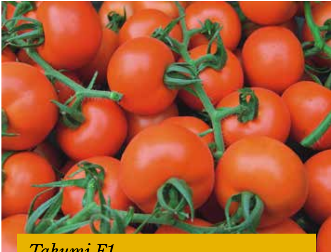
Takumi F1 Truss Medium

Medium vigorous plant for long cycle cultivation 16-18 cluster early maturity. Cluster with an average of 7-8 fruits with good coloration. Can be used for both single pick or cluster.