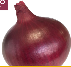
Ruby Star F1 Onion Rijnsburger

Earliest maturing red onion for long storage in North Europe. The variety grows strong in early season and bulbing starts right after the longest day. Uniform, fine neck and good yield.