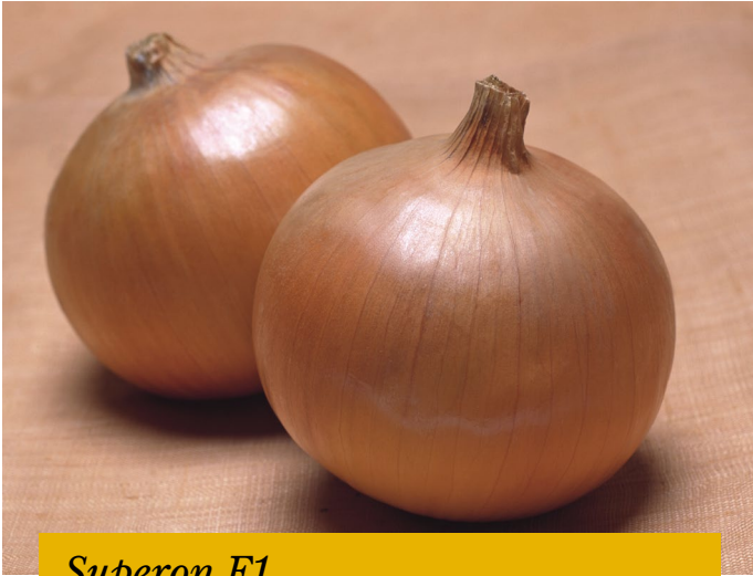
Superon F1 Early long day

Forms a strong root system and a vigorous plant. Adaptable for various growing conditions. The fine neck makes easy and fast drying possible. Strong in single centres. Excellent skin quality.