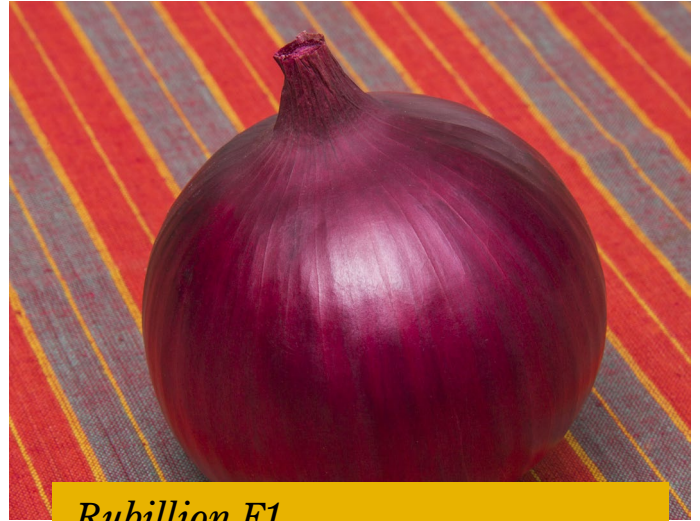
Rubillion F1 Early long day red

TYPE LONG DAY | MARKET FRESH, MEDIUM STORAGE | MATURITY EARLY | LATITUDE RANGE 45°- 50° | AVERAGE SIZE 60-80 MM | BULB SHAPE ROUND | SKIN COLOUR SHINY BROWN