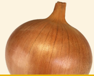
Bruce F1 Onion Rijnsburger

TYPE RIJNSBURGER | MARKET LONG STORAGE | MATURITY EARLY | LATITUDE RANGE 45°-55° | AVERAGE SIZE 50-70 MM | BULB SHAPE ROUND, SLIGHTLY FLAT | SKIN COLOUR YELLOW BRONZE