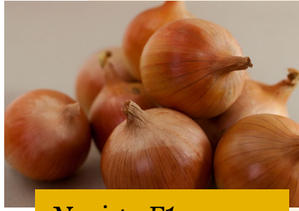
Novista F1 Onion Rijnsburger

TYPE RIJNSBURGER | MARKET LONG STORAGE | MATURITY EARLY | LATITUDE RANGE 45°-55° | AVERAGE SIZE 50-70 MM | BULB SHAPE ROUND, SLIGHTLY FLAT | SKIN COLOUR RED